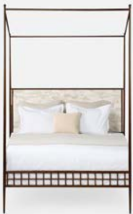
HAMILTON BED QUEEN: 82"L X 62"W X 90"H, KING: 82"L X 78"W X 90"H, CAL KING: 86"L X 74"W X 90"H