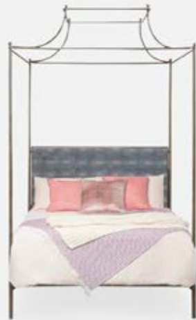
JANELLE BED TWIN: 77"L X 41"W X 108"H, QUEEN: 82"L X 62"W X 108"H, KING: 82"L X 78"W X 108"H, CAL KING: 86"L X 74"W X 108"H