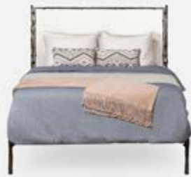
BRENNAN BED QUEEN: 82"L X 62"W X 56"H, KING: 82"L X 78"W X 56"H, CAL KING: 86"L X 74"W X 56"H