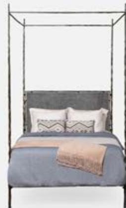
BRENNAN TALL CANOPY TWIN: 77"L X 41"W X 102"H, QUEEN: 82"L X 62"W X 102"H, KING: 82"L X 78"W X 102"H, CAL KING: 86"L X 74"W X 102"H