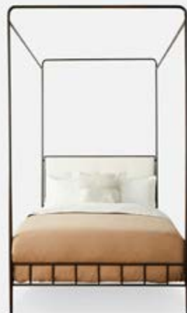
LAKEN QUEEN: 82"L X 63"W X 106"H, KING: 82"L X 78"W X 106"H, CAL KING: 87"L X 75"W X 106"H