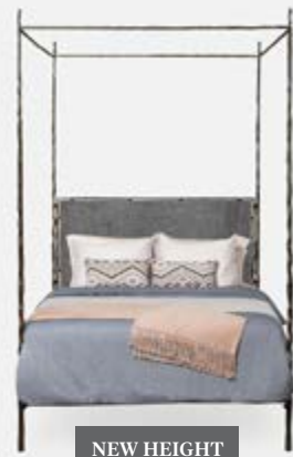
BRENNAN SHORT CANOPY QUEEN: 82"L X 62"W X 90"H, KING: 86"L X 74"W X 90"H, CAL KING: 82"L X 78"W X 90"H