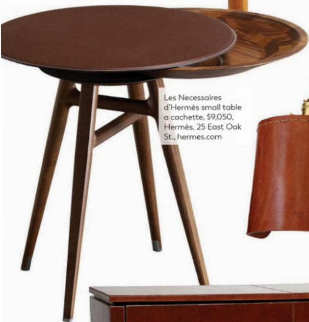
Les Necessaires d'Hermès small table a cachette, $9,050, Hermès, 25 East Oak St., hermes.com