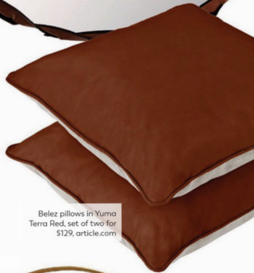
Belez pillows in Yuma Terra Red, set of two for $129, article.com