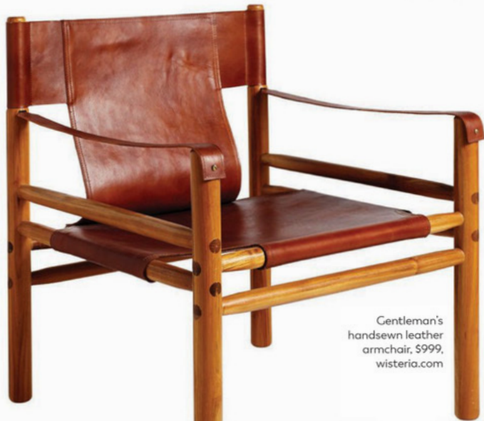
Gentleman's handsewn leather armchair, $999, wisteria.com