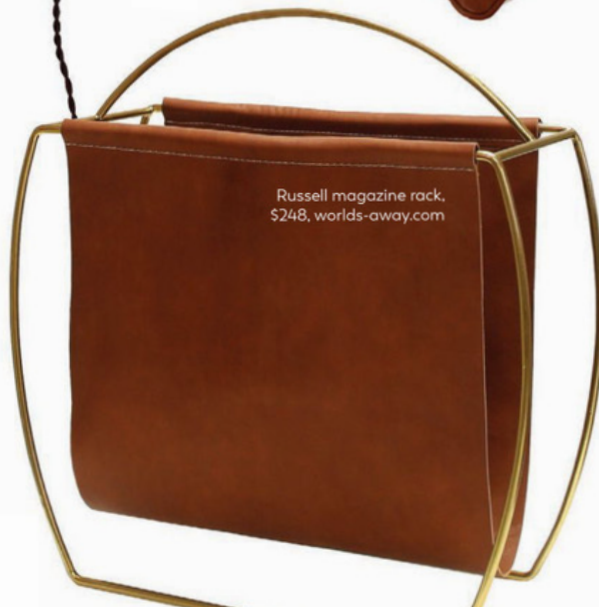
Russell magazine rack, $248, worlds-away.com