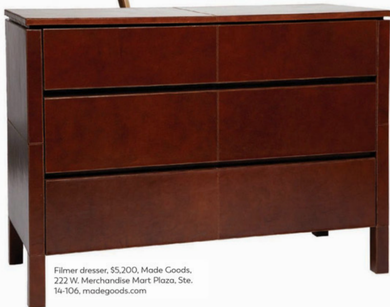
Filmer dresser, $5,200, Made Goods, 222 W. Merchandise Mart Plaza, Ste. 14-106, madegoods.com