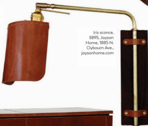
Iris sconce, $895, Jayson Home, 1885 N. Clybourn Ave., jaysonhome.com