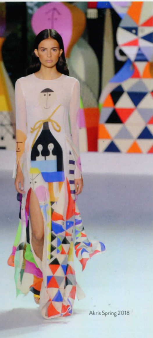
Akris Spring 2018