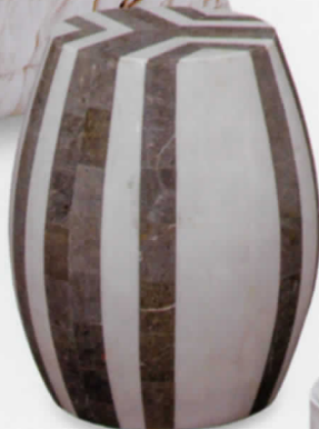
PALECEK "DALI" STOOL, $768/MECOX

Students can sculpt whatever inspires them—animals, photos, or sketched ideas are used as starting points for creativity. Learn about what materials and techniques are needed to make your sculpture bookshelf-worthy. creativeartscenter.org