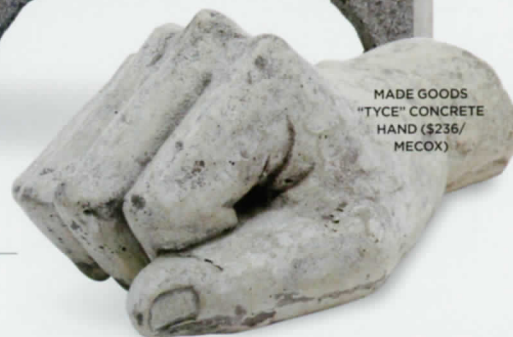
MADE GOODS "TYCE" CONCRETE HAND ($236/ MECOXX)