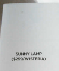
SUNNY LAMP ($299/WISTERIA)