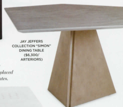
JAY JEFFERS COLLECTION "SIMON" DINING TABLE ($6,300/ ARTERIORS)