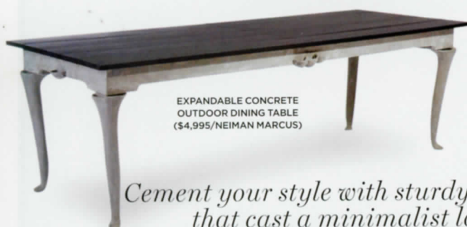
EXPANDABLE CONCRETE OUTDOOR DINING TABLE ($4,995/NEIMAN MARCUS)