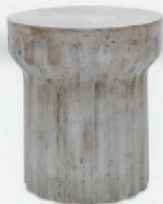
MADE GOODS "YARDLEY" SIDE TABLE ($600/MECOXX)