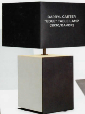
DARRYL CARTER "EDGE" TABLE LAMP ($930/BAKER)