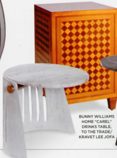
BUNNY WILLIAMS HOME "CAREL" DRINKS TABLE, TO THE TRADE/ KRAVET LEE JOFA

This stool reminds us of French artist Daniel Buren's "Les Deux Plateaux" art installation in the Palais-Royal courtyard.