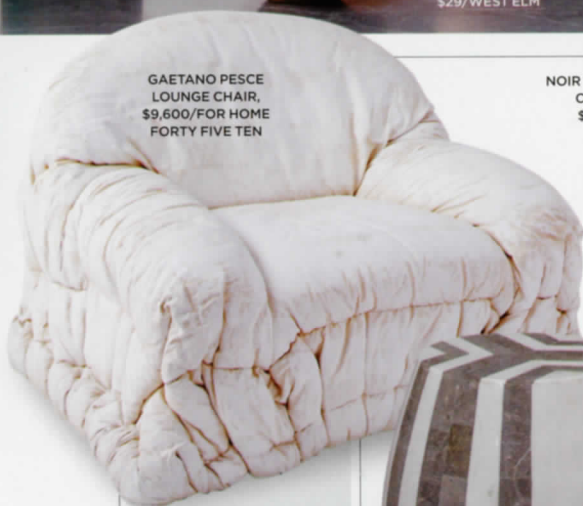
GAETANO PESCE LOUNGE CHAIR, $9,600/FOR HOME FORTY FIVE TEN