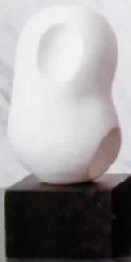
KELLY WEARSTLER "OLEUM" SCULPTURE, $1,550/FORTY FIVE TEN