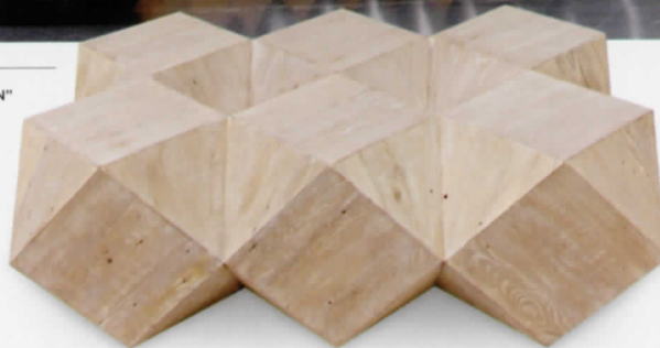
TABLE MANNERS: GEOMETRY PAIRED WITH BLACK AND WHITE ALWAYS LOOKS RIGHT