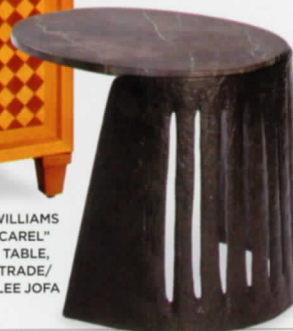
CASTE DESIGN "STINE" TABLES, TO THE TRADE/ HOLLY HUNT