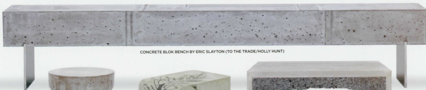
CONCRETE BLOK BENCH BY ERIC SLAYTON (TO THE TRADE/HOLLY HUNT)