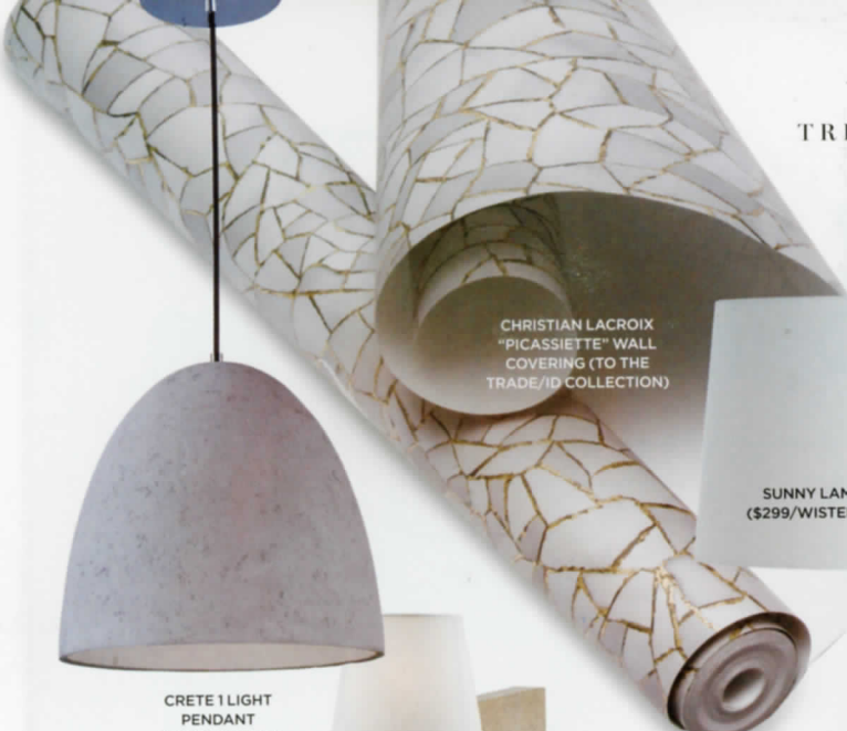
SUNNY LAMP ($299/WISTERIA)