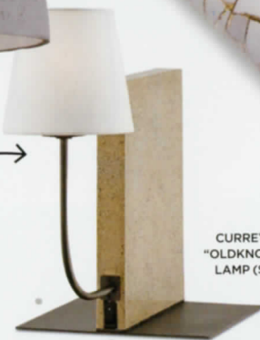
CURREY & COMPANY "OLDKNOW" BOOKCASE LAMP ($690/MECOXX)

Sticks and stone Hand-applied concrete is placed atop brass pipes and plates.