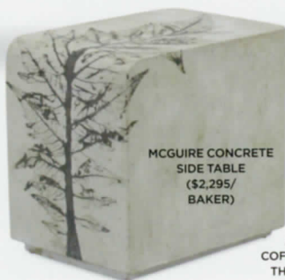
MCGUIRE CONCRETE SIDE TABLE ($2,295/ BAKER)